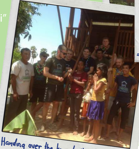
Handing over the keys to the family