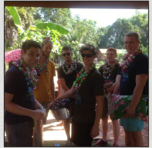
Handmade necklaces from the children of House #33 =JULY 2015=